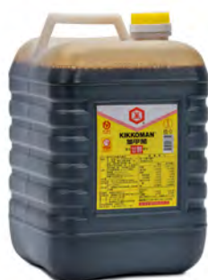
Kikkoman Soya Sauce 6L