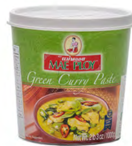
Mae Ploy Green Curry Powder 1kg