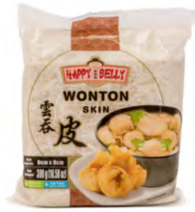
Happy Belly Wonton Wrappers 9cm 30s