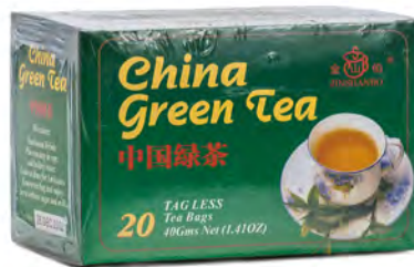
Jinshabbo China Green Tea 20s