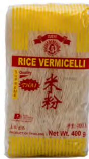
Suree Rice Vermicelli 400g