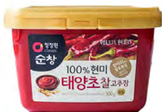
Gochujang Korean Red Pepper Paste 1kg

Discover fresh and ready-to-use deli favourites inspired by Asian cuisine.