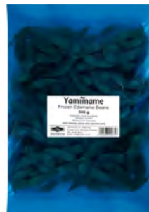
Yamimame Edamame Soya Beans in Pod 500g

GET IN TOUCH WITH US FOR MORE FROZEN ESSENTIALS