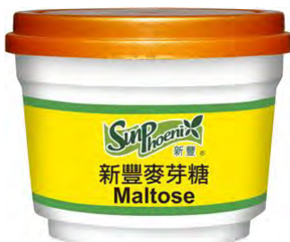
Sun Phoenix Maltose 500g