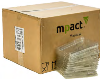
mpact Sushi Lid Clear 38F 300's