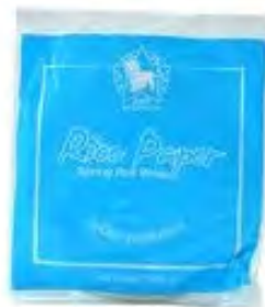
Star Lion Rice Paper Round 16cm 100g