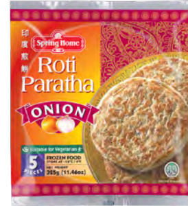
Spring Home Roti Paratha Wrappers Onion Flavour 325g