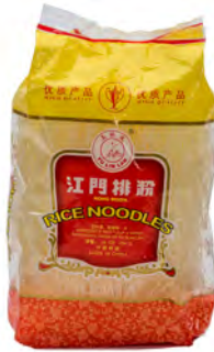
Kongmoon Rice Noodles 454g