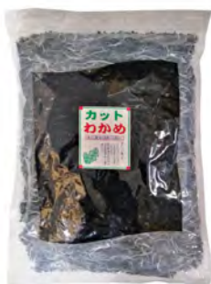
Tayio Konbu Seaweed 500g