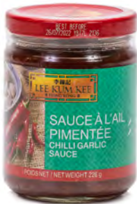
Lee Kum Kee Chilli Garlic Sauce 226g