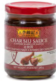
Lee Kum Kee Char Siu Sauce 240g