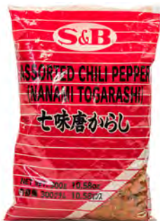
S&B Assorted Chilli Peppers 300g