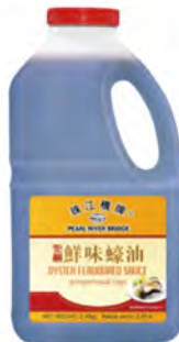
Pearl River Bridge Oyster Pearl River Bridge 2.35kg