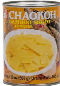
Chaokoh Bamboo Shoot in Water 565g