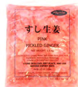
My Asia Pickled Ginger 1.5kg