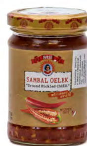
Suree Sambal Oelek 227g