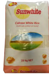
Sun White Calrose Sushi Rice 25kg