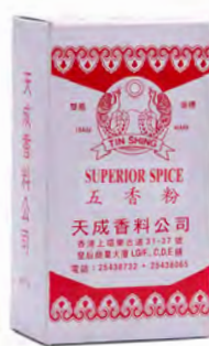
Tin Shing Chinese Five Spices Powder 454g

GET IN TOUCH WITH US FOR MORE SPICES & SEASONING