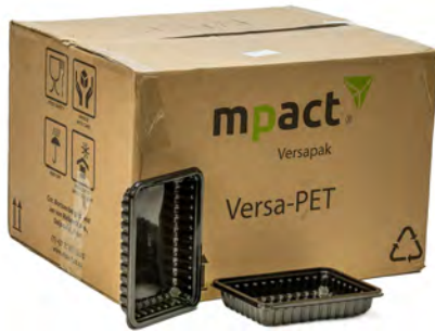
mpact Sushi Tray Black 38F 300's

From chopsticks to takeaway containers, stock up on essentials that make service simple.