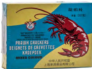
Ou Jiang Brand Prawn Crackers 227g