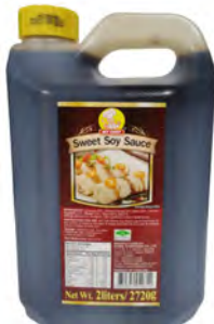
My Chef Sweet Soy Sauce 2L