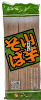
Unbranded Soba Noodles 200g

GET IN TOUCH WITH US FOR MORE GRAIN, RICE & SEEDS