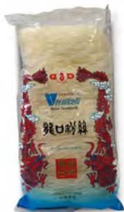
Longkou Bean Vermicelli 500g