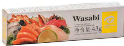
Tianpeng Wasabi Paste 43g

GET IN TOUCH WITH US FOR MORE DELI TREATS