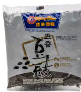
Koon Chun Salted Black Beans Spiced 227g