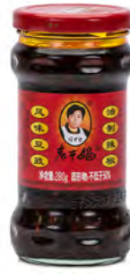
Lao Gan Ma Black Bean in Chilli Paste 280g