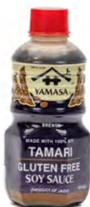
Yamasa Tamari Gluten Free Soya 500ml

GET IN TOUCH WITH US FOR MORE VERSATILE CONDIMENTS