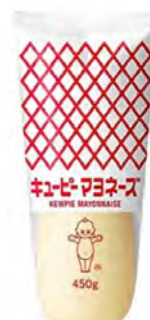
Kewpie Mayonnaise 450g