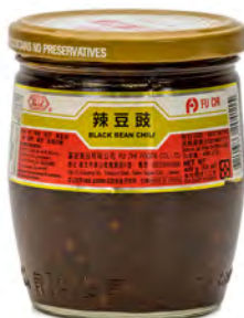
Fu Chi Black Bean Chilli 400g