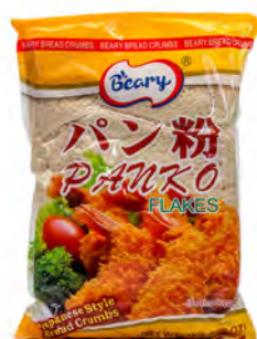
Beary Japanese Bread Crumbs 1kg