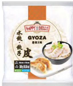
Happy Belly Gyoza Skins 300g

Convenience meets quality with our wide range of frozen Asian favourites, ready when you are.