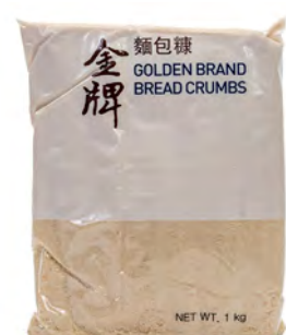
Golden Brand Japanese Bread Crumbs 1kg