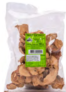
Thai Top Choice Dried Galangal 100g