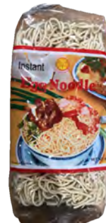
Long Happiness Egg Noodles 400g