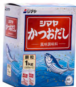
Katfuwo Chi Hondashi 1kg