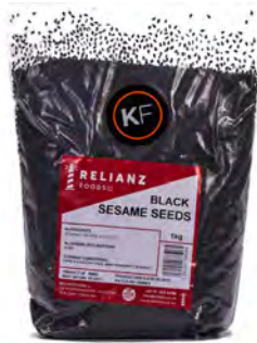
KF Preferred Black Sesame Seeds 1kg

The heart of Asian cooking — premium rice, wholesome grains, and nutrient-rich seeds.