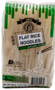
Suree Rice Noddle Sticks 5mm 250g