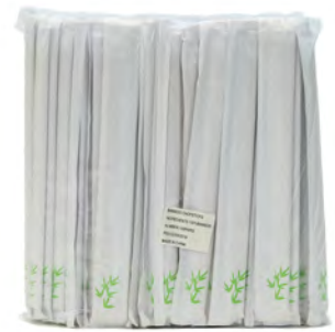
KF Preferred Chopsticks Paper Wrap 20cm 100s

GET IN TOUCH WITH US FOR MORE DISPOSABLE PACKAGING