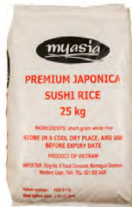
My Asia Sushi Rice 25kg