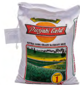
Punjabi Gold Basmati Rice 5kg