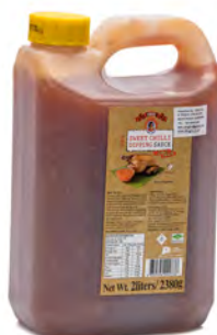
Suree Sweet Chilli Dipping Sauce 2L