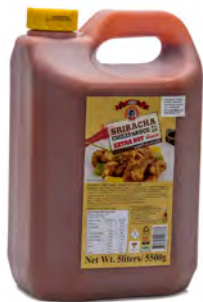
Suree Sriracha Extra Hot Chilli 5L