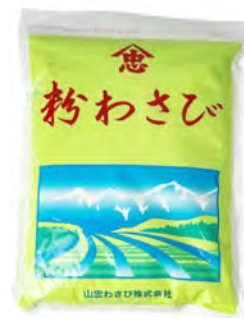
MyAsia Wasabi Powder 1kg

GET IN TOUCH WITH US FOR MORE ORIENTAL PRODUCTS