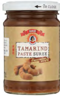
Suree Tamarind Paste 227g