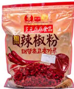
Asian Food Services Korean Red Pepper Powder 1kg

Unleash authentic flavours with our aromatic range of Asian seasonings and spices.