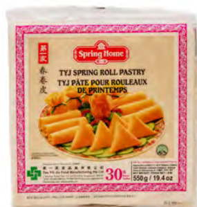
Spring Home Springroll Wrapeprs 250mm 30s