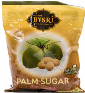
Bysri Palm Sugar 400g

All the little extras you need to complete your Asian kitchen, in one place.