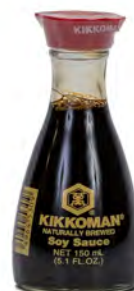
Kikkoman Soya Sauce 150ml