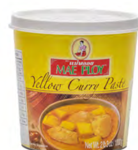
Mae Ploy Yellow Curry Powder 1kg