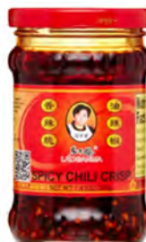
Lao Gan Ma Spicy Chilli Crisps 210g