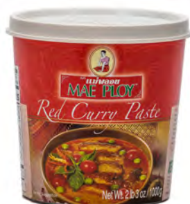
Mae Ploy Red Curry Paste 1kg