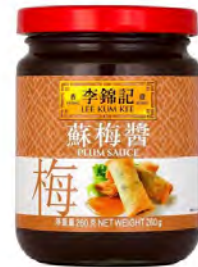
My Chef Plum Sauce 260g