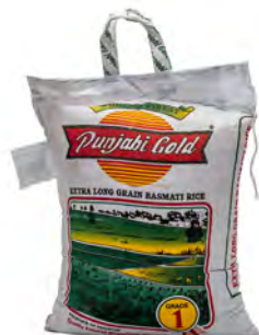
Punjabi Gold Basmati Rice 2kg