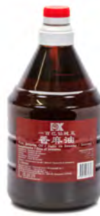
Hua Khlang Sesame Oil Pure Aseana 2L