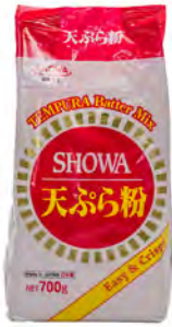
Showa Tempura 700g

GET IN TOUCH WITH US FOR MORE ESSENTIAL PRODUCTS