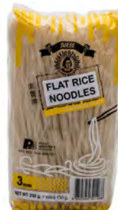
Suree Rice Noddle Sticks 3mm 250g