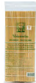
KF Preferred Sushi Rolling Mat Disposable