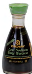
Kikkoman Soya Sauce Less Salt 150ml