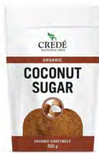
Crede Coconut Sugar 300g