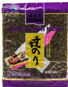
Kaitatuya Nori Seaweed Roasted 50s 140g

Explore a vibrant selection of spices, sauces, and staples from the Far East.